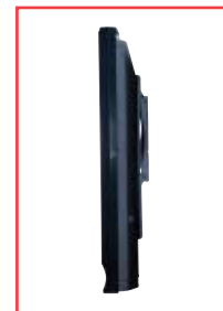
Ultra-slim design holds screen 1.7" from the wall